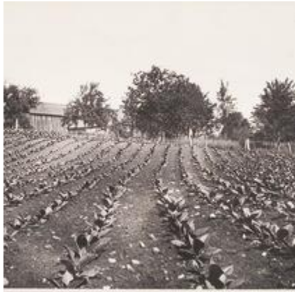
MILLS FARM, TOBACCO GROWING, CANTON CENTER

https://ink.nbmaa.org/collections/46816/19th-century-landscapes-a