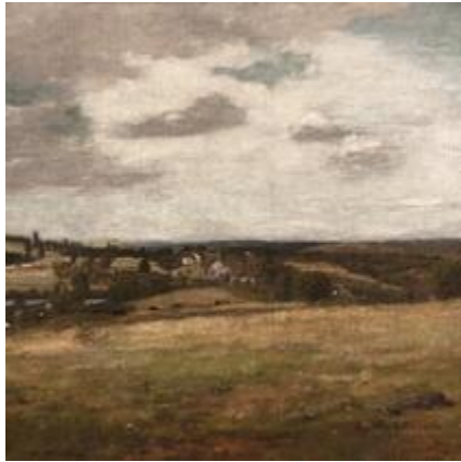
Wilcox Farm, 1881, Lyman Allan Art Museum, CT

CO - Students will be able to develop a work of art that is based upon previous knowledge and is personal to them