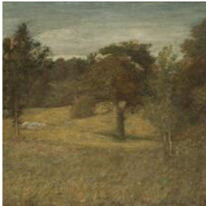
Weir's Orchard 1885, Wadsworth Atheneum, Hartford, CT