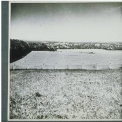
Shade grown tobacco Portland CT 1902

https://ctdigitalarchive.org/islandora/search/photos%20tobacco%20farms%20ct?page=3&type=edismax