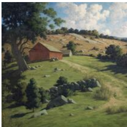
Old Lyme landscape, Lyman Allan Art Museum, CT