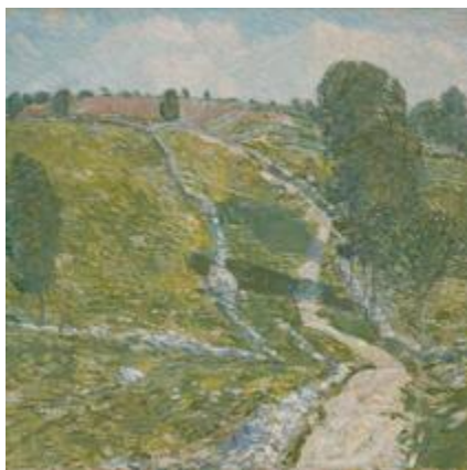
Road in the Land of Nod, Wadsworth Atheneum